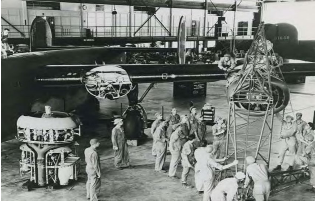
B-24 maintenance training was taught at Keesler's Airplane and Engine Mechanics School until 1945.

In late July 1944, the Army Air Forces (AAF) consolidated all air-sea rescue training at Keesler. The situation worsened on 4 January 1945, when the AAF Training Command ordered Keesler to give priority to air-sea rescue training. The Emergency Rescue School disbanded in April 1946. Thereafter, air-sea rescue training passed to the Air Transport Command's newly established Air Rescue Service.