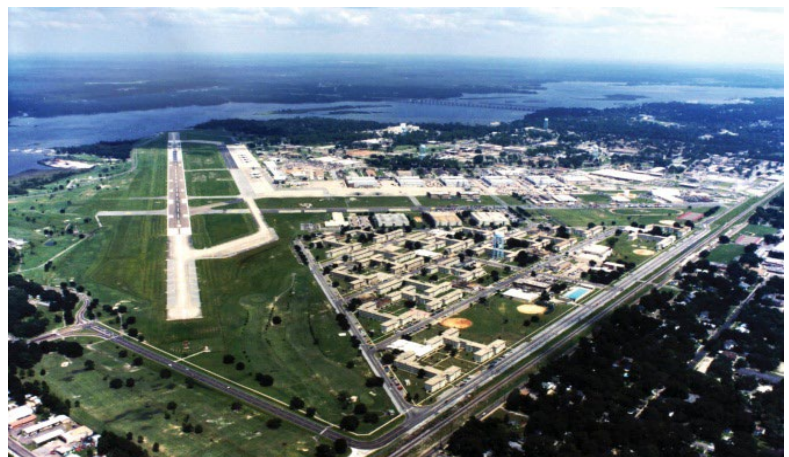
Keesler AFB's premier "Triangle Vision."

The end of the Cold War and subsequent military drawdown caused the armed services to refocus on a long dormant issue, namely participation in the Interservice Training Review Organization (ITRO)—a review of military programs to eliminate training duplication and reduce training costs through consolidation. The first results of ITRO made themselves felt at Keesler in 1995, when the ITRO Executive Board determined that all DoD Calibration training would be consolidated at Keesler. The first contingent of students arrived in 1996, as the Navy closed offices and moved equipment from San Diego, California, and Norfolk, Virginia, to Keesler. The Marine Corps followed in 1997, as it