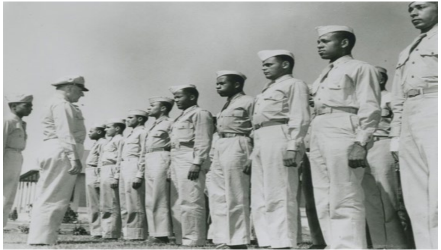
Keesler's first graduating class of African-American airplane mechanics, 1944.

Generally unknown to most was the role that the Tuskegee Airmen and other African-American troops played on Keesler. In fact, more than 7,000 African-American soldiers were stationed at Keesler Field by the autumn of 1943. These soldiers included pre-aviation cadets, radio operators, aviation technicians, bombardiers, and aviation mechanics. Many others, like First Sergeant Lucius Theus, a future major general, also served with distinction in Keesler's permanently assigned African-Americans units. Keesler also trained a small number of black aircraft mechanics from the Tuskegee Institute. These African-American service members took a giant step forward in their goal of winning wars on two fronts - the struggle against racism at home and the fight against foreign enemies abroad.