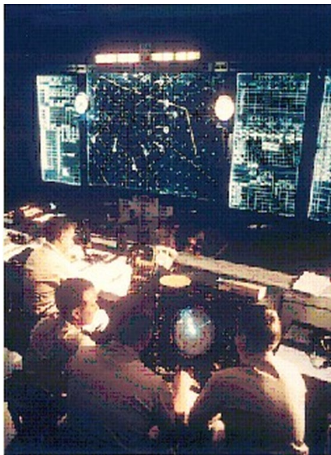
Advances in evolving technology rapidly led to changes in Keesler's training.

By the mid-1960s, the United States was beginning to deploy substantial forces to Southeast Asia. The Vietnam War buildup caused base-wide shortages of everything from uniforms to post office boxes, but it also returned pilot training to Keesler for the first time since 1953. On 15 January 1967, the 3389th Pilot Training Squadron was activated and equipped with T-28 Trojans. Its mission was to teach Military Assistance Program (MAP) students how to fly. The squadron hosted personnel from many countries, including Iran, Mexico, and Peru, but especially from South Vietnam. Of the 908 pilots who graduated before the squadron