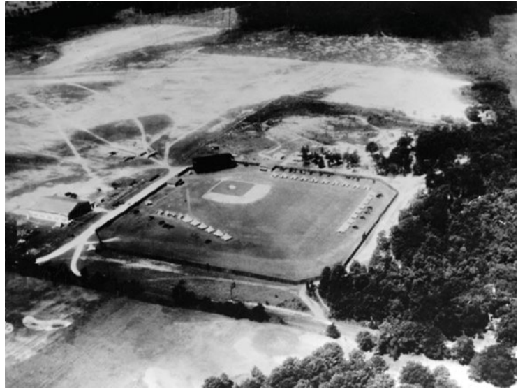
The Biloxi airport, ballpark, and golf course as it appeared in 1941.